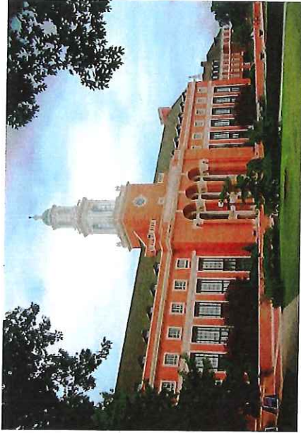
Oklahoma State University