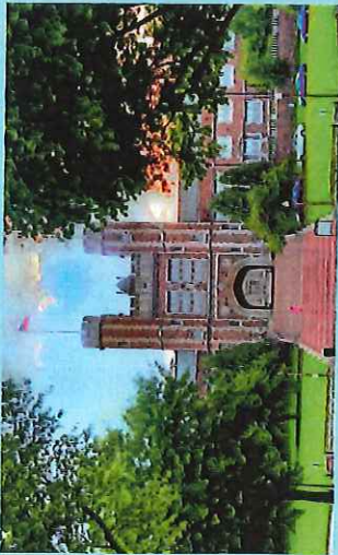
Washington University in St. Louis