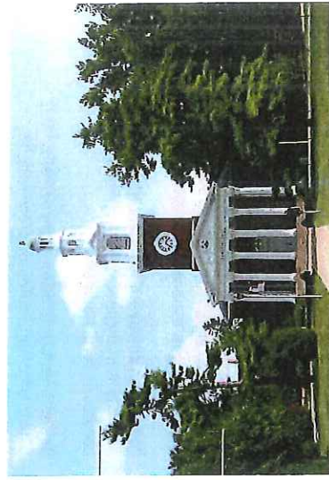
University of Kentucky

10. Visit our website for more information.