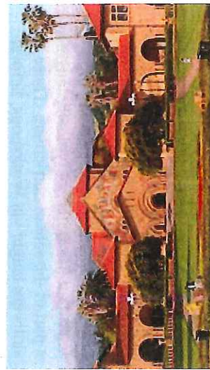
Stanford University, CA